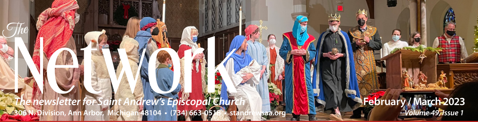
Above: Christmas Pageant, 2022

As this reaches you, I will have spent six months in Ann Arbor as your Interim Rector. The search process continues at full speed, and we have much to accomplish before a new Rector arrives. Here are some of the things I see, both as an Interim, and as things I would hope have been addressed if I were to move to a new position as a called Rector.