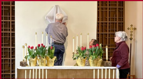
PREPARING THE ALTAR OF REPOSE