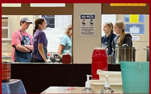
J2A VOLUNTEERS AT THE BREAKFAST