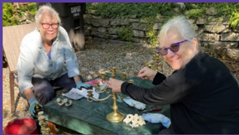
ALTAR GUILD WORK