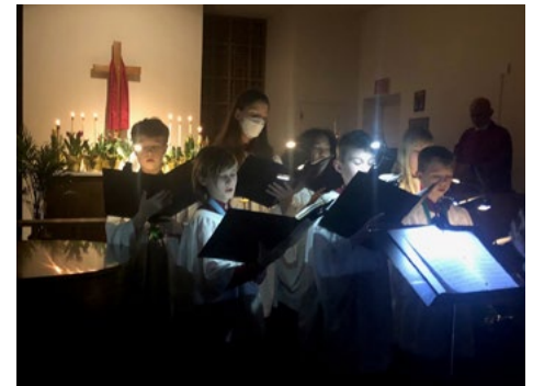
At the Altar of Repose on Maundy Thursday