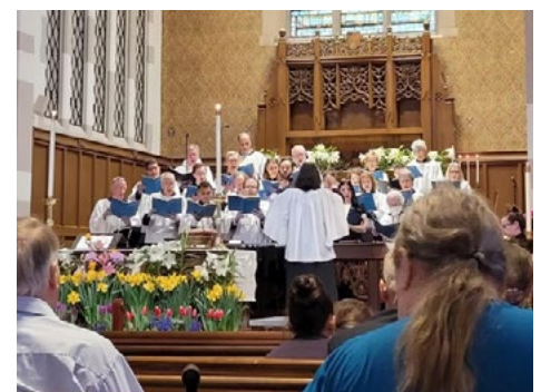
Easter Musical Prelude