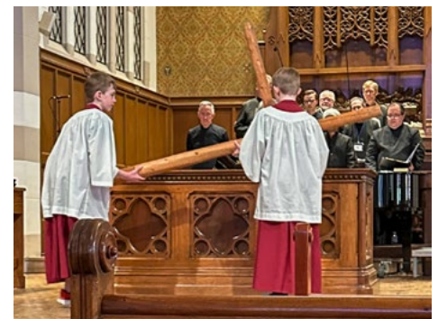
Procession of the Cross on Good Friday