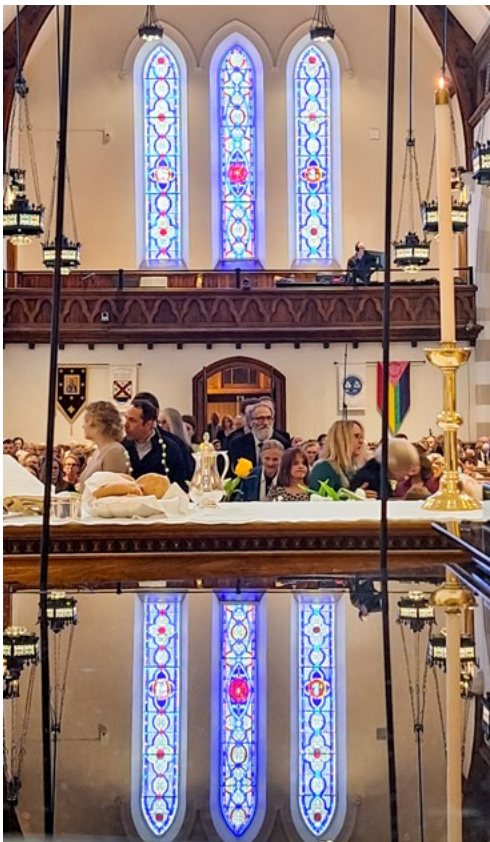
The West Windows during Communion