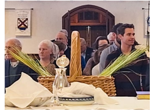
Communion on Palm Sunday