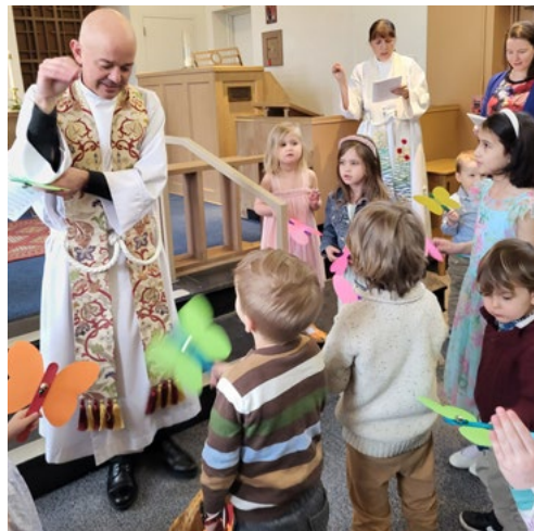
Easter Family Service