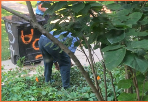
VOLUNTEER GARDENERS HARD AT WORK

Send your snaps of summer at St. Andrew's to communications@standrewsaa.org !