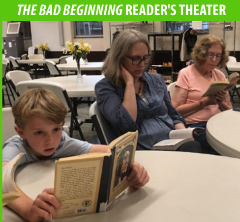
THE BAD BEGINNING READER'S THEATER