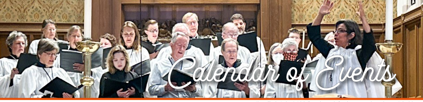
Above: The St. Andrew's Adult Choir rehearses before the service on September 10 · K. Riedel