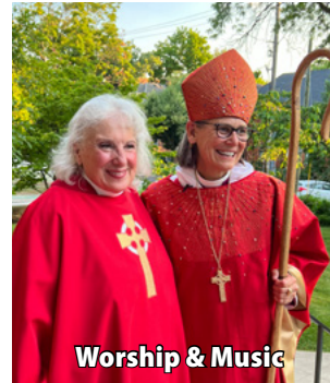
Worship & Music