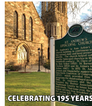
CELEBRATING 195 YEARS