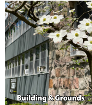
Building & Grounds