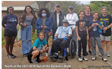
Youth at the 2021 AFSP Out of the Darkness Walk

In support of work in the greater Church community, St. Andrew's gives nearly 10% of our operating budget to the Diocese of Michigan each year (also known as our Diocesan Apportionment). In addition to this tithe, parishioners give nearly an equivalent 10% as non-budgeted in-kind gifts to our greater community. Even though it is not included as a line item in our annual budget, parishioners consistently contribute at this level to a variety of outreach initiatives year after year.