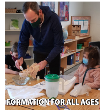
FORMATION FOR ALL AGES