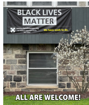
ALL ARE WELCOME!

October 23: Flu Shots available 8:30-11am for $40 ($54 high-dose), sponsored by EHM