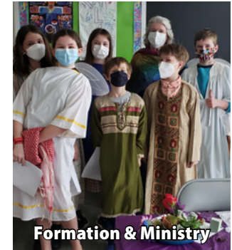
Formation & Ministry