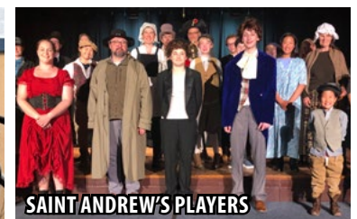
SAINT ANDREW'S PLAYERS