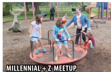
MILLENNIAL + Z MEETUP

We are hoping that everyone at St. Andrew's will join with this leadership group and do their best to support our mission and ministry in the year ahead.