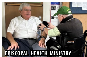
EPISCOPAL HEALTH MINISTRY