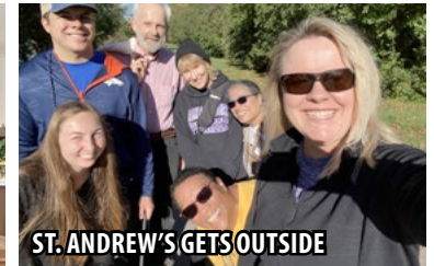
ST. ANDREW'S GETS OUTSIDE