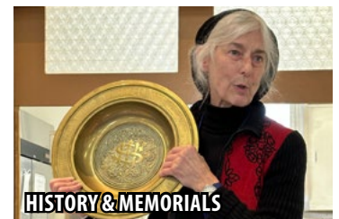
HISTORY & MEMORIALS