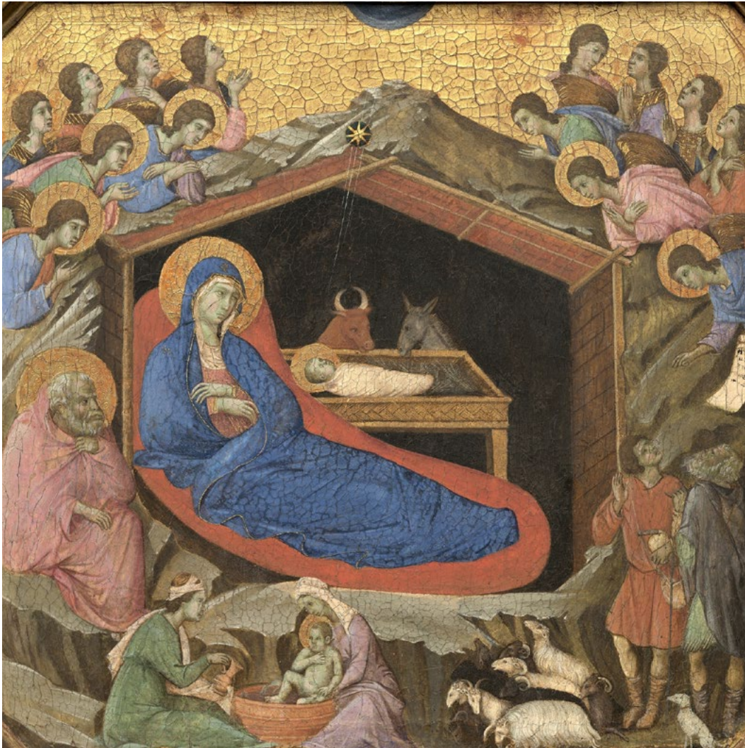
Birth of Christ, 1308-1311