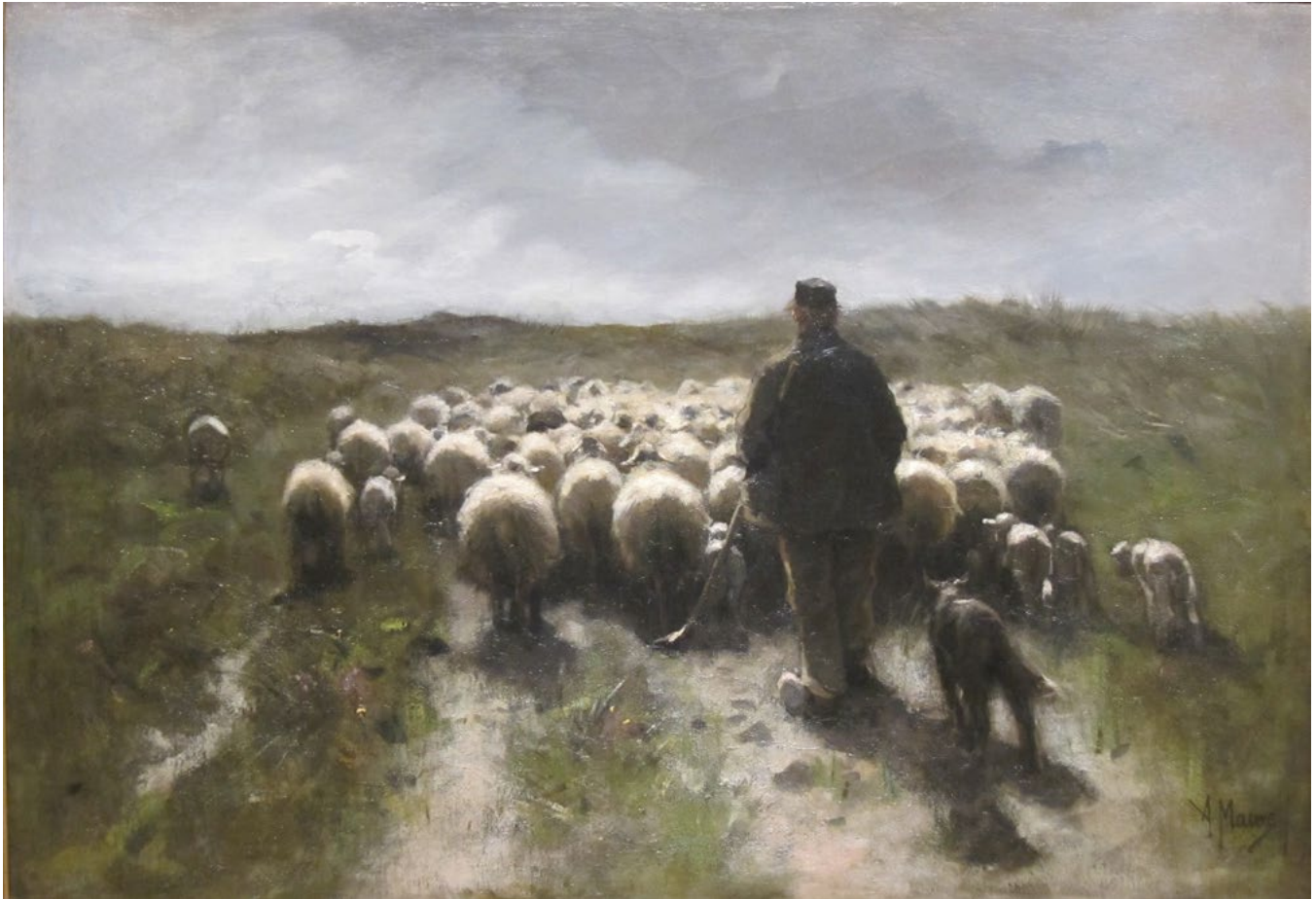
Landscape with Shepherd and Sheep , ca. 1880

306 N. Division Street., Ann Arbor, MI 48104 • (734) 663-0518 standrewsaa.org