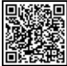
SIGN-UP TO DONATE FOOD