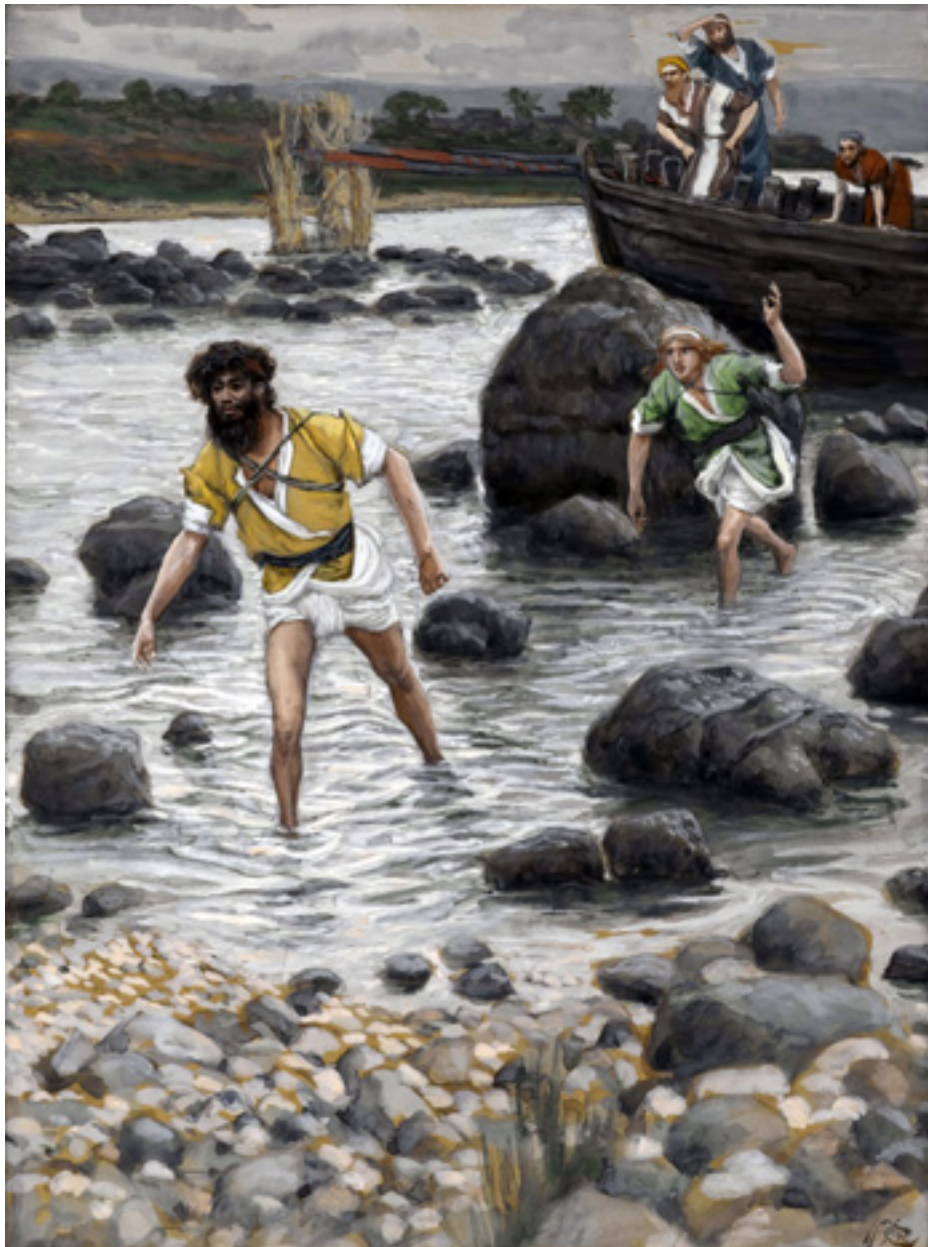
Calling of Saint James and Saint John