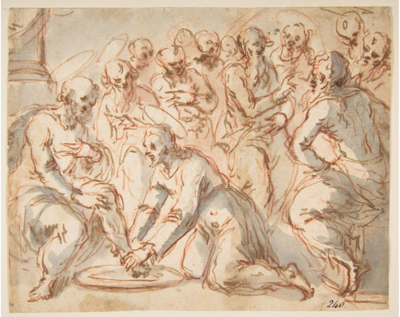
Christ Washing the Disciples' Feet

306 N. Division Street., Ann Arbor, MI 48104 • (734) 663-0518 standrewsaa.org