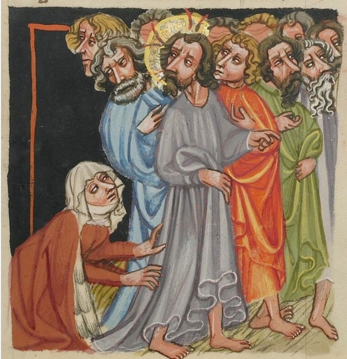
Healing of a Woman with an issue of blood, 1400-1410