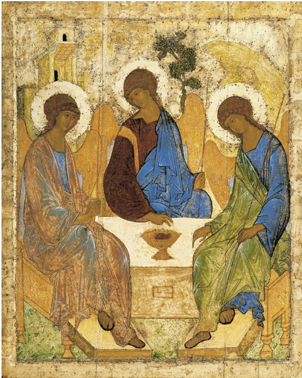
The Trinity or The Hospitality of Abraham, c. 1411

306 N. Division Street., Ann Arbor, MI 48104 • (734) 663-0518 standrewsaa.org