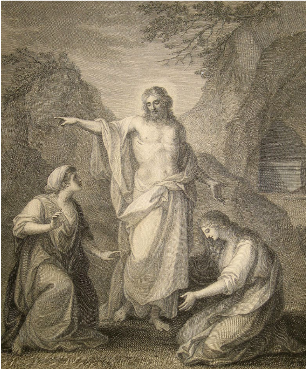
The Macklin Bible - Christ Appearing to the Marys, 1794

306 N. Division Street., Ann Arbor, MI 48104 • (734) 663-0518 standrewsaa.org