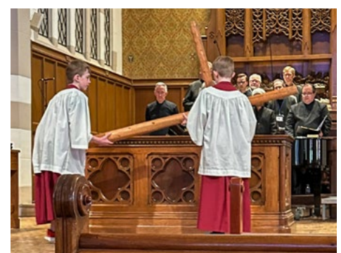
Procession of the Cross on Good Friday