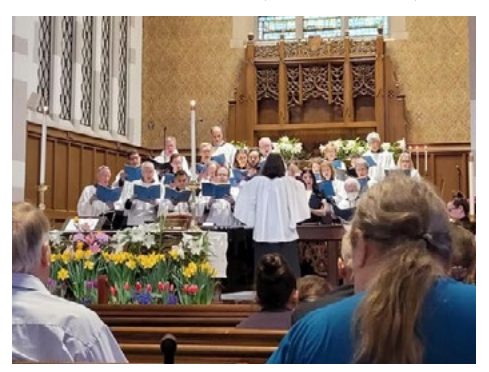
Easter Musical Prelude