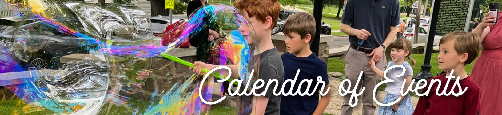
Above: Children celebrate the end of the Sunday School year with Bubbles on the Lawn on Sunday, June 8, 2025